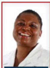
MODERN MNGISI AUXILIARY NURSE